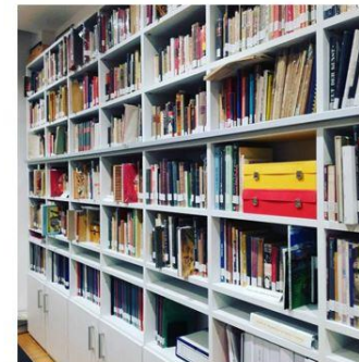
artirciceni • Segui già artirciceni Una biblioteca dedicata a tutti gli amanti del circo: artisti, curiosi, professionisti, formatori, lettori, studenti e professori... il circo si è trasferito in via s. Teresa, 12 a Verona con la più importante collezione a e d'archivio più importante d'Italia aperta al pubblico. #circuscollection #centrostudi #circushistory #discoveria #university #research #circuslovers #circusmirabilia #designinspiration #circusphotography #cinematology #circusartprints #veronalibrary #discovenerona #circusbooks #bookstagramme #bookstagram #booklovers #instabook #ontheshelf Piace a 15 persone 16 DICEMBRE 2017 Aggiungi un commento...

CEDAC also has in its collection: philatelic material, correspondence, stage objects and costumes, as well as some small circus family archive complexes, related to both entrepreneurial activity and the sphere family.