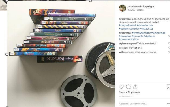
artirciceni • Segui già CEDAC - Verona artirciceni Collezione di dvd di spettacoli del circo da solei conservata al cedac! #circussolei #dvdcollection #designinspiration #instacircus artirciceni #creativeDesign #homedesign #circuslove #circuslife #dvdlover #circusinspiration stylemeleopard This is wonderful arsigne Perfect one! wilddrawteam I like your artworks Piace a 23 persone 18 MARZO 2016 Aggiungi un commento...