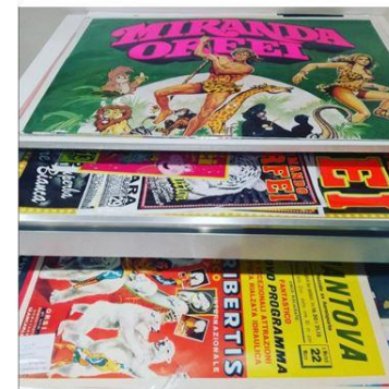
artirciceni • Segui già artirciceni È stato un periodo pieno di cambiamenti... finalmente è stato completato il trasloco presso la nuova sede di via s. Teresa, 12 a Verona. Nonostante le feste abbiamo lavorato dietro le quinte per organizzare nuove attività e progetti. Prima di tutto una bella riorganizzata all'archivio #manifesti, che saranno i protagonisti del nuovo anno! #graphicdesign #grafica #pubblicita #daquianno #designinspiration #graphicposter #creativeDesign #circusposter #circusgraphic #poster #vintageposter #artprint #instacircus #cedacdesign #homedesign #reproduction #circusarchive #circuslibrary Piace a 29 persone 8 GENNAIO Aggiungi un commento...