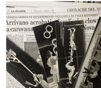
artirciceni • Segui già artirciceni #scattifotografico in #blackandwhite conservati presso il #CEDAC. Non assomigliano a un #magalano? #blackandwhitephotography #blackandwhitephoto #originalart #books #circusinspiration #booklovers #bookmark #bookmarks #originality #circusbook #bookinspiration #librarylove #circusarchives #circuslibrary #multimedia #reading #circus #circusphotography #cinque #lessezchen #signet #marcadores # Piace a 28 persone 16 DICEMBRE 2017 Aggiungi un commento...